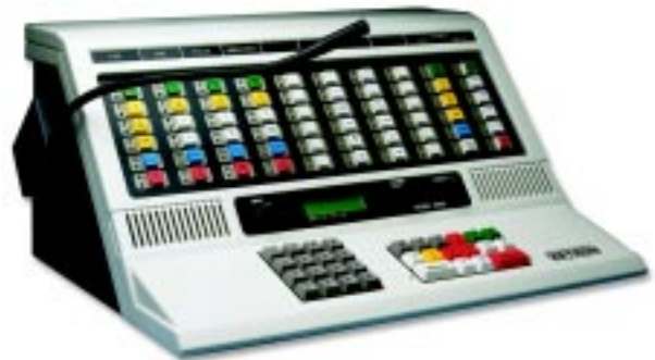
Model 4010 Desktop