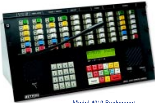
Model 4010 Rackmount